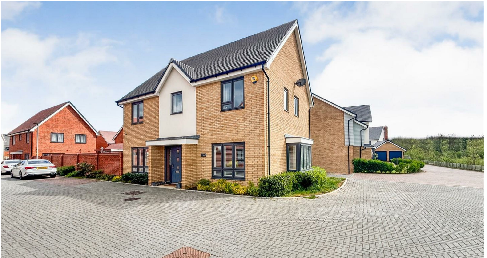
Gilbert Walk, Wootton, Bedford, MK43 9RW Offers over £520,000 Freehold